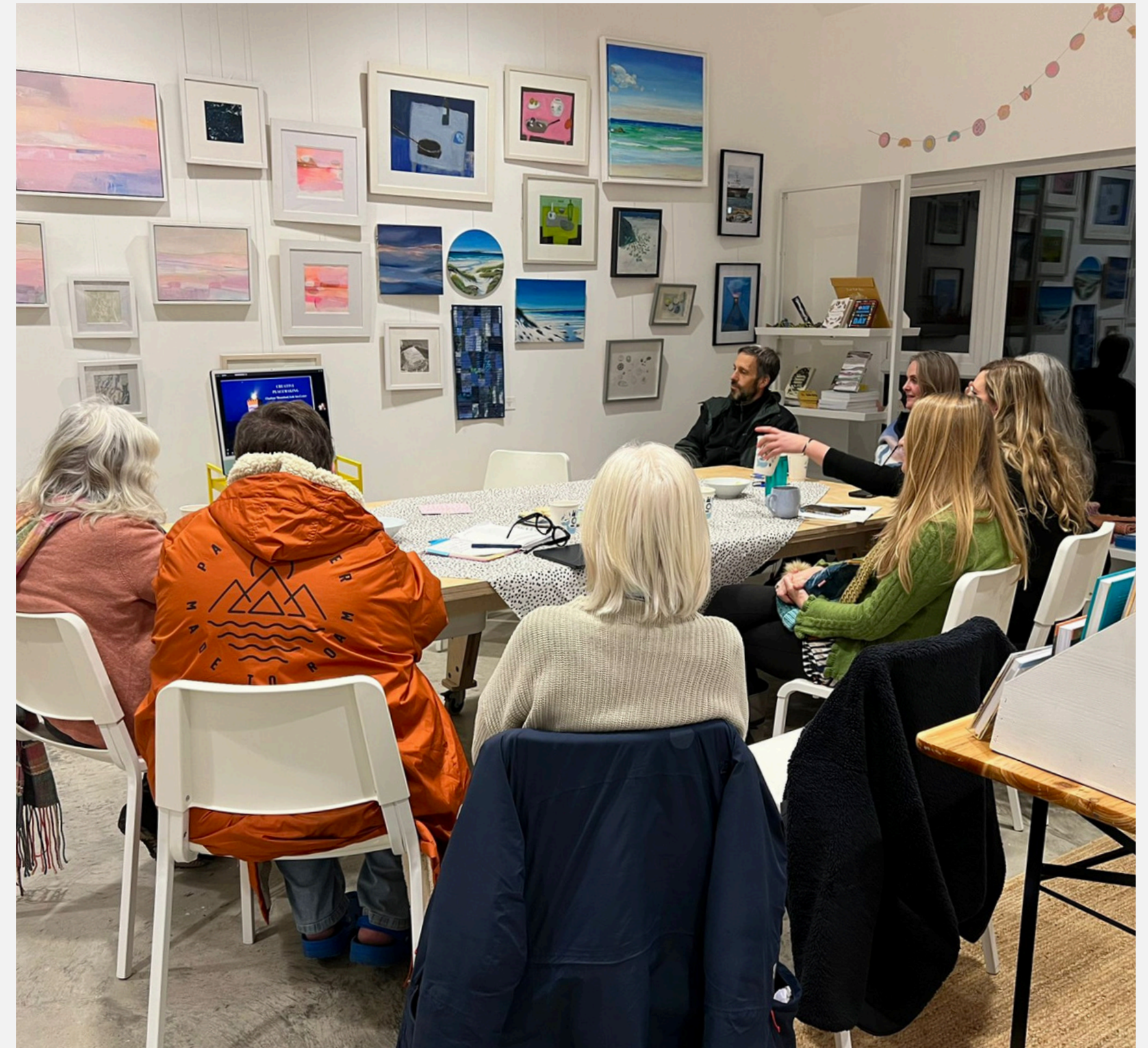
Ràmh Culture Café Tìree © Tìree Makery