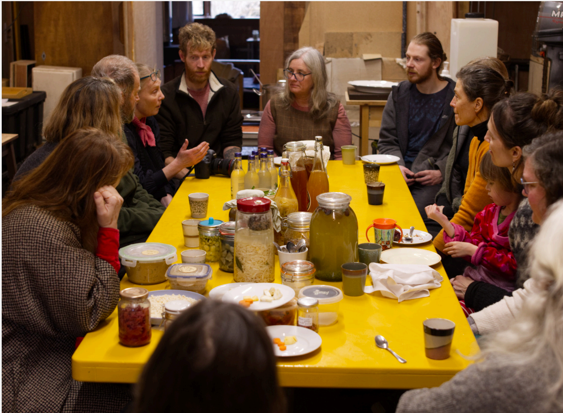
Ràmh Beacons, Mull, January 2025