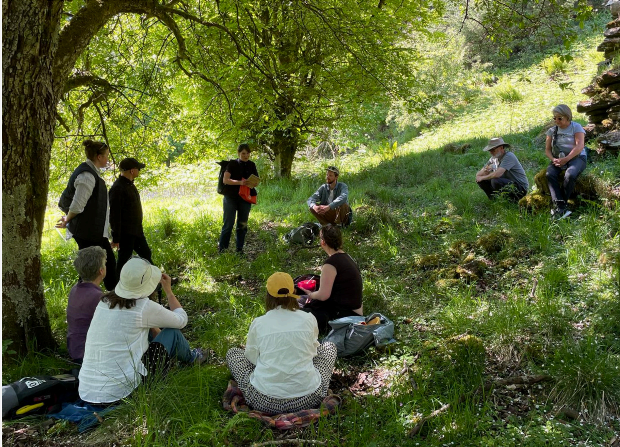
Dùthchas Beò, Kilmory Oib, May 2025